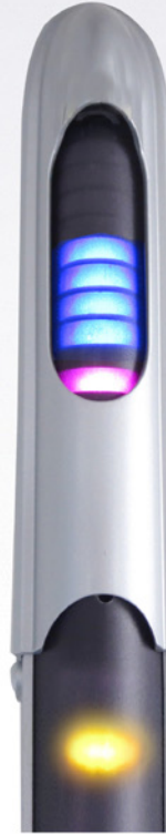
Located the ferrous hazard with amber lights in column