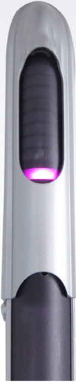
Monitoring the ambient magnetic field without lights in column