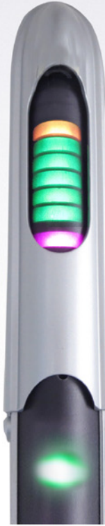
Scanning the user with green lights in column